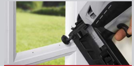
Second Fix Applications